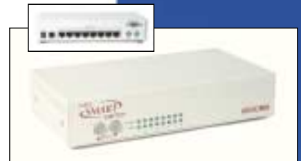
Smart CAT5 Switch, 8 Ports