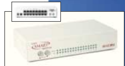
Smart CAT5 Switch, 16 Ports