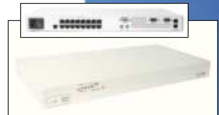
Smart 16 IP Switch