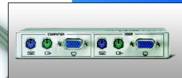
Receiver Unit rear view