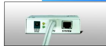
Transmitter Unit rear view